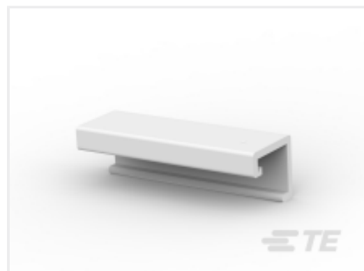
TE Part # CAT-104MTA-PLSCC Polyester PCB Connector Covers: 2.54 mm, MTA 100