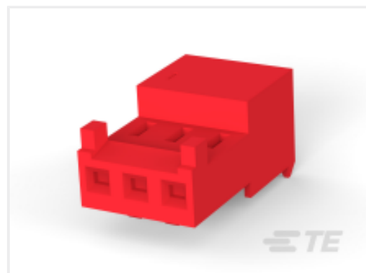
TE Part # CAT-104MTA-NTPMR Nylon Tin Plated Receptacle: 2.54 mm, with Mating Alignment, MTA 100