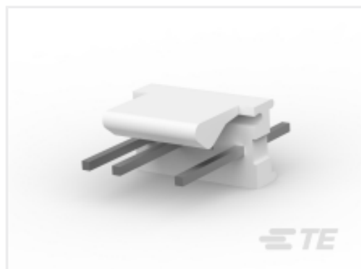
TE Part # 643431-1 04P MTA100 HDR ASSY W/O#2