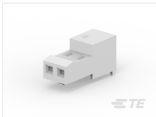
TE Part # CAT-104MTA-NTPNR MTA Receptacle: Nylon, Tin Plated, 2.54 mm