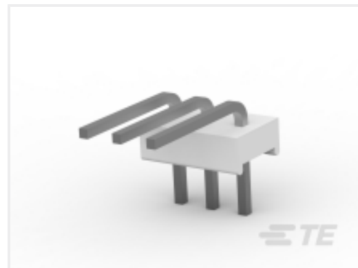
TE Part #640457-2 PCB Header: Polyester, Right Angle, Unshrouded