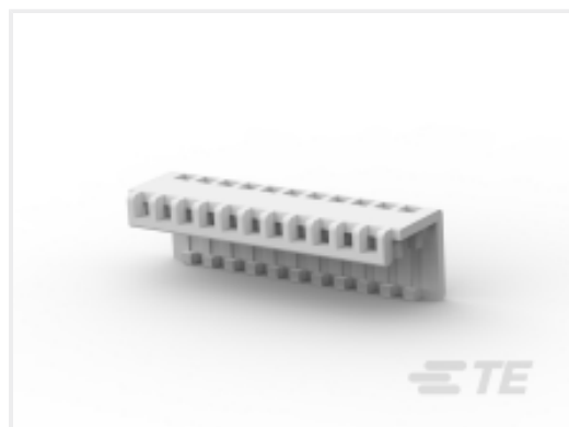
TE Part # CAT-104MTA-NYLCC Nylon PCB Connector Covers: 2.54 mm, MTA 100