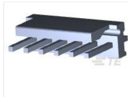
TE Part #640445-6 06P MTA156 HDR ASSY FL/STR SN