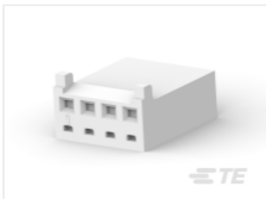
TE Part # 1375820-4 CST-100 II HOUSING 4 POS