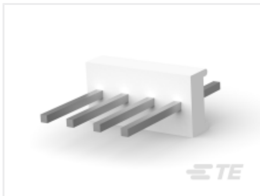
TE Part #640456-9 PCB Header: Polyester, Vertical, Unshrouded, No Mating Alignment