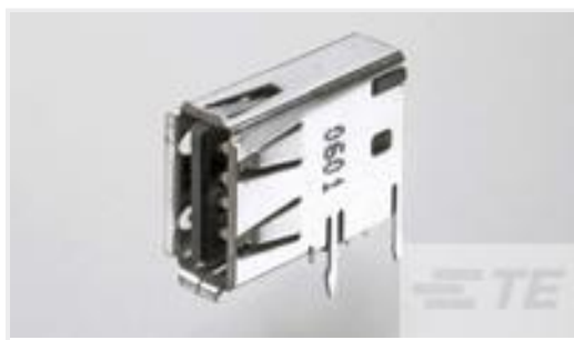
TE Part #292336-1 Std USB Type A, Flag, T/H