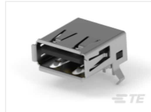
TE Part #1-292303-2 USB A R/A RCPT ASSY THRU HOLE, LEAD FREE