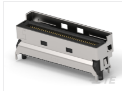
TE Part #1-2379397-9 MCIO INTERGRATED CONN, V/T,8X, SMT TYPE