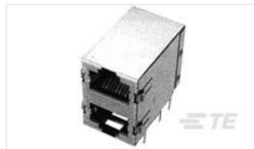
TE Part #5569381-1 STK MJ ASSY,8POS,2X1,SHLD,CAT5