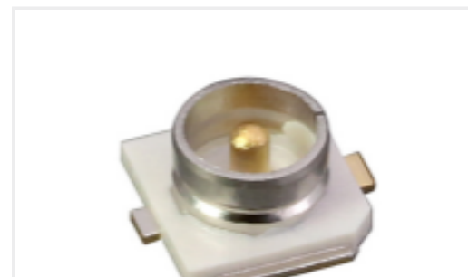
TE Part #CONMHF1-SMD-T U.FL/MHF1 Jack 50 Ohm PCB Surface Mount