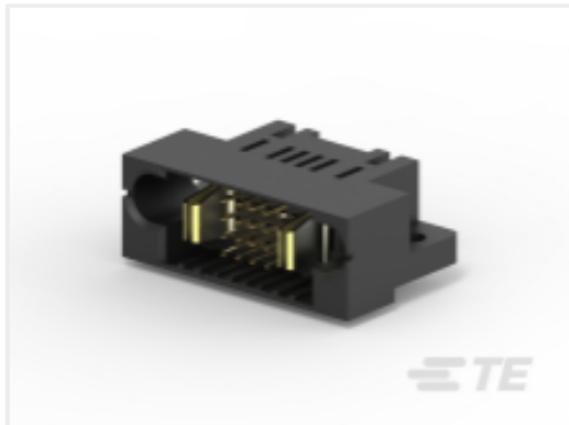
TE Part #1-6600132-0 MBXL R/A HDR DB 1P+16S+1P