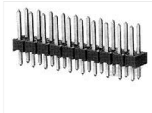
TE Part #6-146256-7 34 MODII HDR DRST B/A .100CL LF