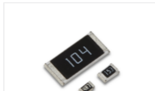
TE Part #3-2176349-7 CRGCQ 2512 10K 1%