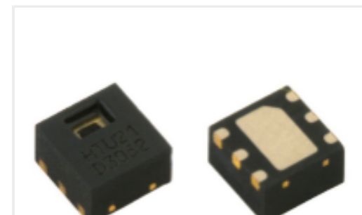
TE Part #HPP845E031R5 I.C 21D RH/T B5000