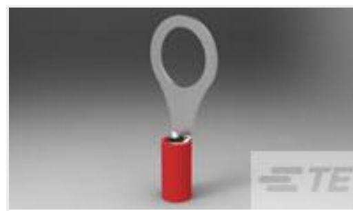
TE Part #328975 PIDG R 22-16COMM 22-18MIL 1/2