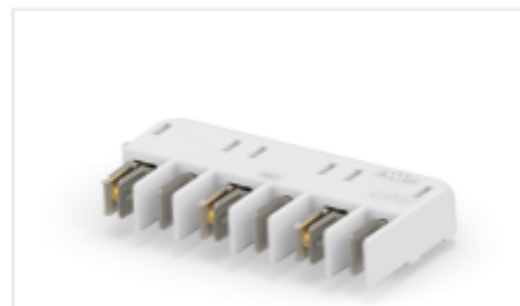
TE Part #2213617-3 HERM BLADE & RCPT, LATCH, POST, SEL GOLD