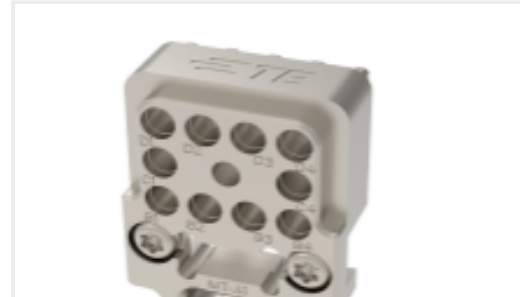
TE Part #2313388-1 Connect Kit, Plug, DC, 10 nanoRF, Trans