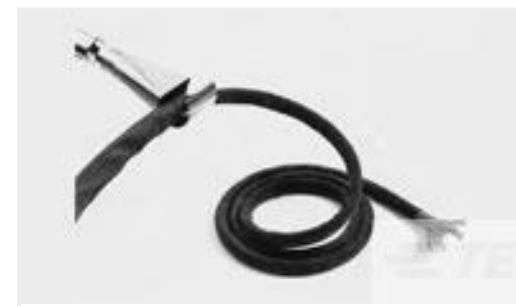
TE Part #CB03314003 RW-200-E-3/16-0-SP