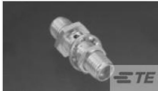
TE Part #1054869-1 2084 0000 02