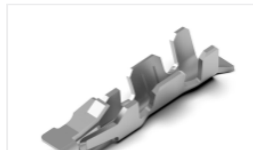
TE Part #2-2316113-3 2MM, REC, CNT, CRIMP, 24-28AWG, TIN, LP