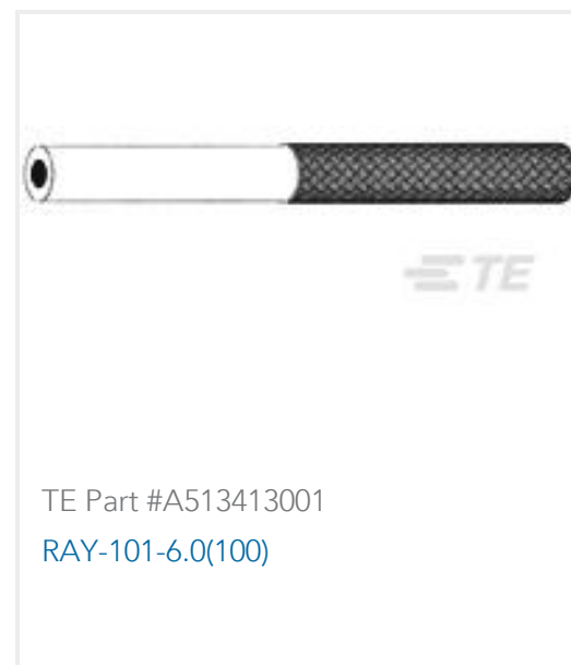
TE Part #A513413001 RAY-101-6.0(100)