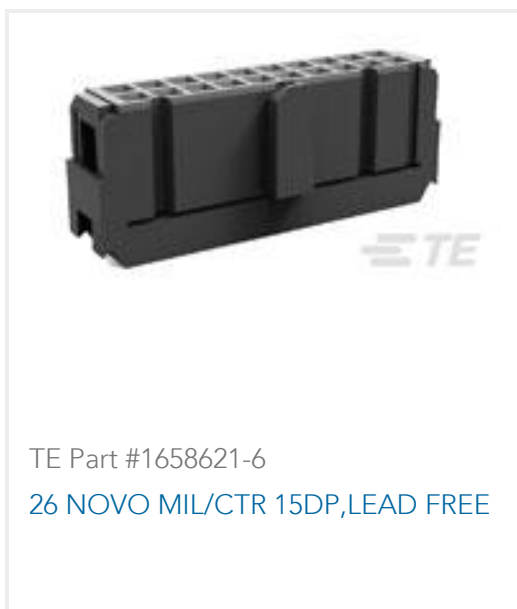
TE Part #1658621-6 26 NOVO MIL/CTR 15DP,LEAD FREE