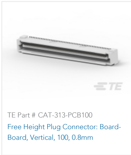
TE Part # CAT-313-PCB100 Free Height Plug Connector: Board-Board, Vertical, 100, 0.8mm