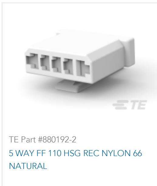
TE Part #880192-2 5 WAY FF 110 HSG REC NYLON 66 NATURAL