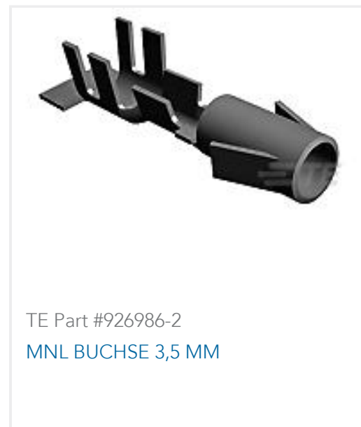
TE Part #926986-2 MNL BUCHSE 3,5 MM