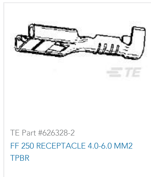
TE Part #626328-2 FF 250 RECEPTACLE 4.0-6.0 MM 2 TPBR