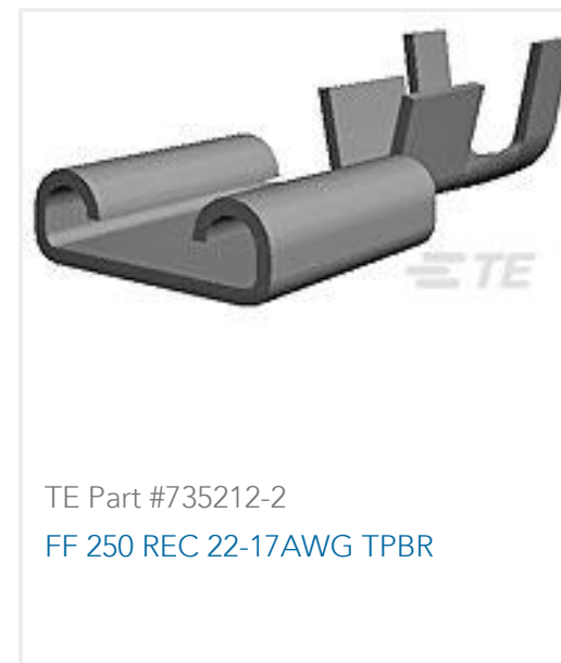
TE Part #735212-2 FF 250 REC 22-17AWG TPBR