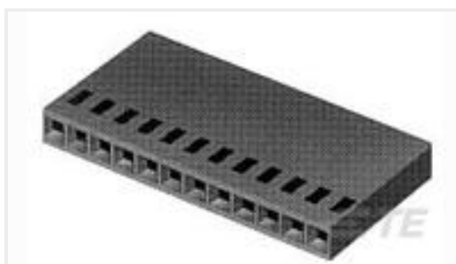
TE Part #87499-3 02 MODIV HSG SR MRKD .100CL