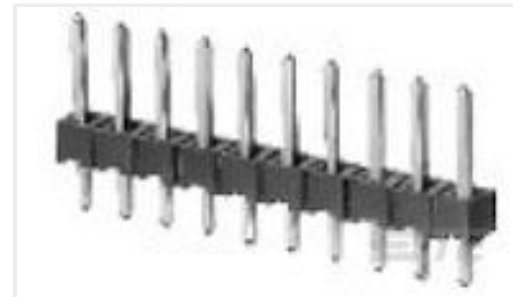
TE Part #5-146280-5 05 MODII HDR SRST B/A .100CL