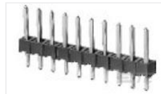
TE Part #5-146281-2 02 MODII HDR SRST B/A LF