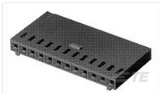
TE Part #102241-4 06 MODIV HSG COMP SR .100 POL