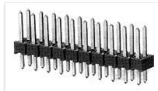
TE Part #5-146256-5 10 MODII HDR DRST B/A .100CL L