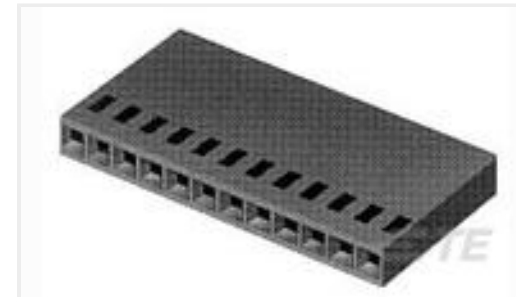
TE Part #87499-6 03 MODIV HSG COMP SR .100CL