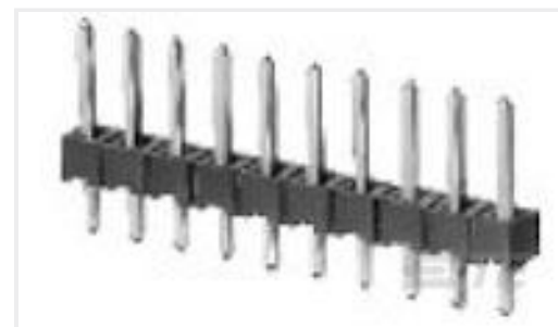
TE Part #5-146281-3 03 MODII HDR SRST B/A LF