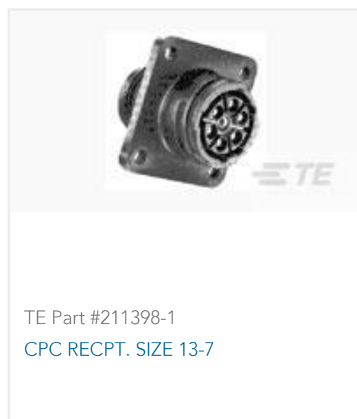
TE Part #211398-1 CPC RECPT. SIZE 13-7