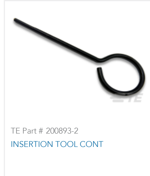
TE Part # 200893-2 INSERTION TOOL CONT