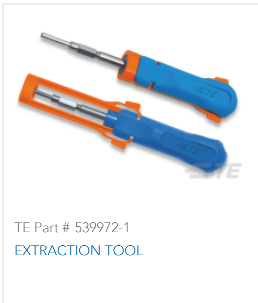
TE Part # 539972-1 EXTRACTION TOOL