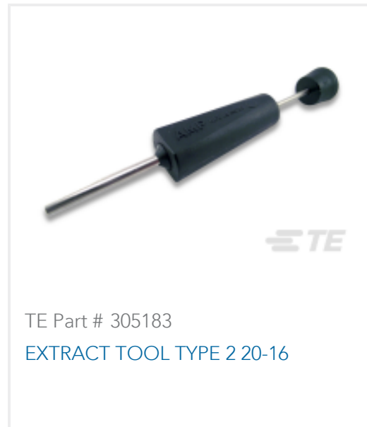
TE Part # 305183 EXTRACT TOOL TYPE 2 20-16