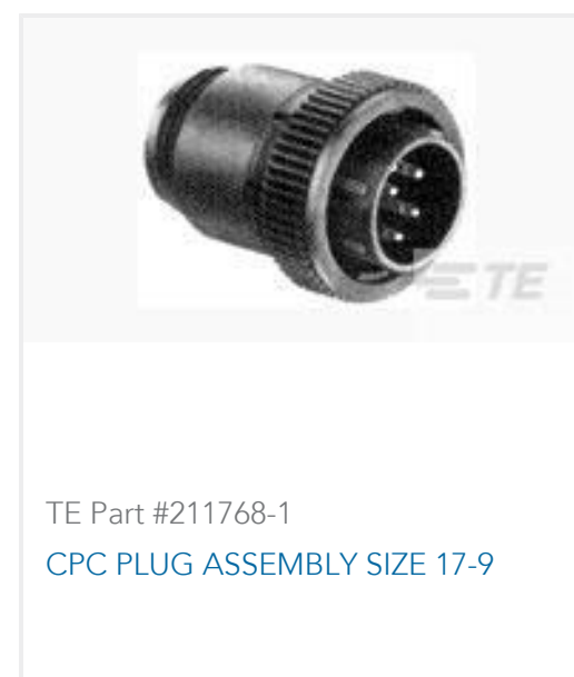
TE Part #211768-1 CPC PLUG ASSEMBLY SIZE 17-9