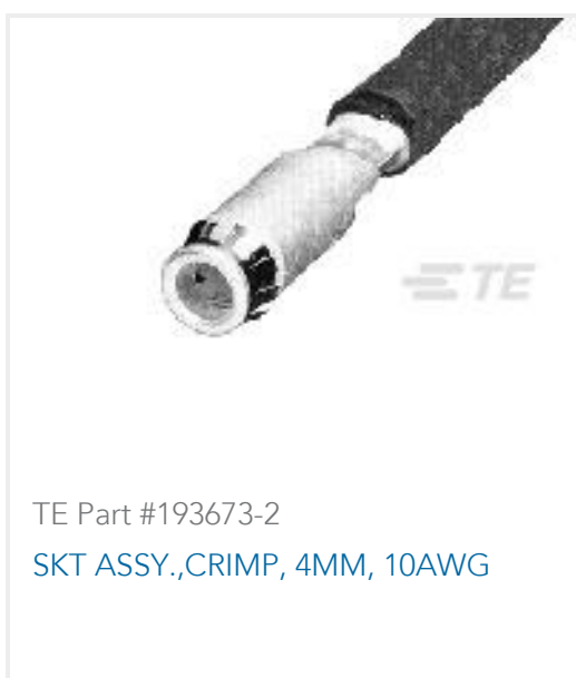
TE Part #193673-2 SKT ASSY.,CRIMP, 4MM, 10AWG