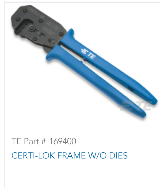
TE Part # 169400 CERTI-LOK FRAME W/O DIES