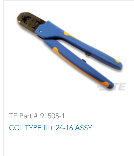
TE Part # 91505-1 CCII TYPE III+ 24-16 ASSY