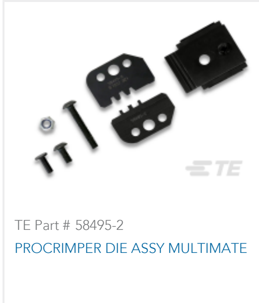
TE Part # 58495-2 PROCRIMPER DIE ASSY MULTIMATE