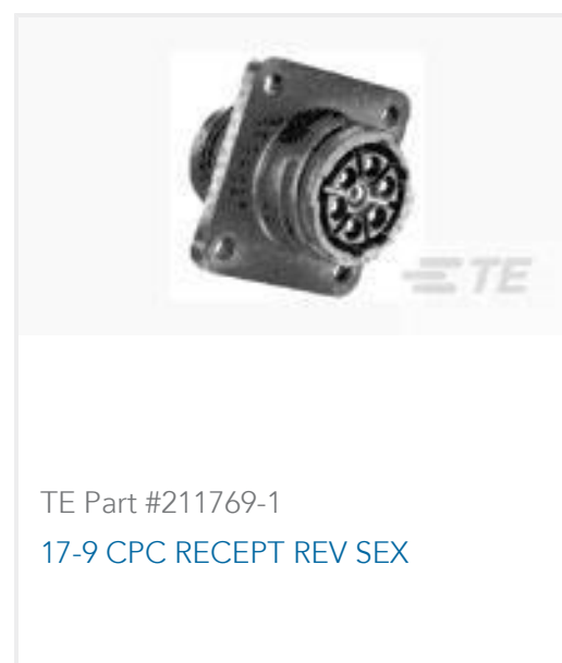
TE Part #211769-1 17-9 CPC RECEPT REV SEX