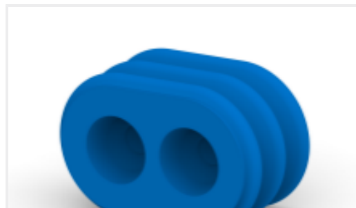
TE Part #2321922-2 REAR WIRE SEAL 2PIN