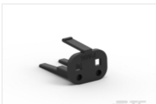
TE Part #2321927-2 FRONT TPA RECEPTACLE, 2 POS