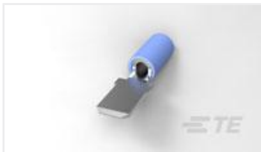
TE Part #66024-4 TAB,PIDG TERMI-BK 16-14