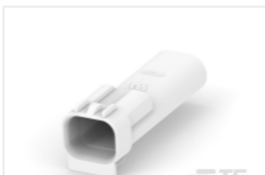
TE Part #2321924-2 RECEPTACLE HOUSING FREE HANGING 2PIN