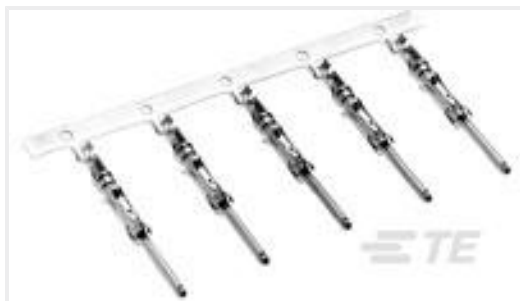
TE Part #66102-4 III+ PIN,24-20,30AU/FL,STRIP