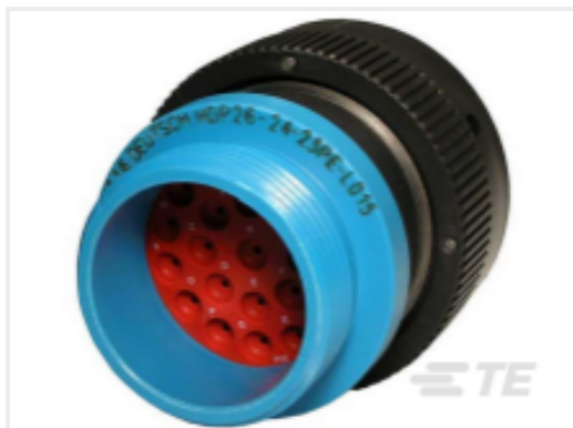
TE Part #HDP26-24-23PE-L015 PLG, 23P, BLK, E, THD, 16, P