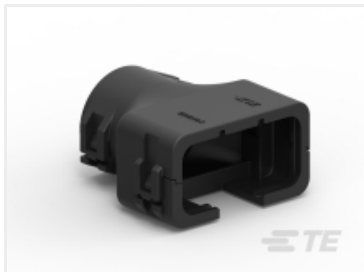
TE Part #2292802-3 AS16,PLUG BACKSHELL KIT,ST,12P, NC16