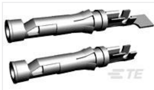
TE Part #66563-4 III+ SKT,24-20,30AU/FL,STRIP