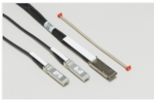
Pluggable I/O Cable Assemblies(39)