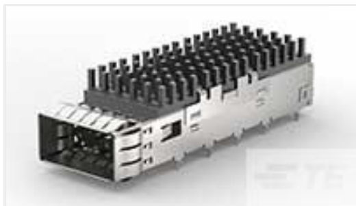
TE Part #2170704-1 CAGE ASSY, QSFP28 1X1, SPRING, HS