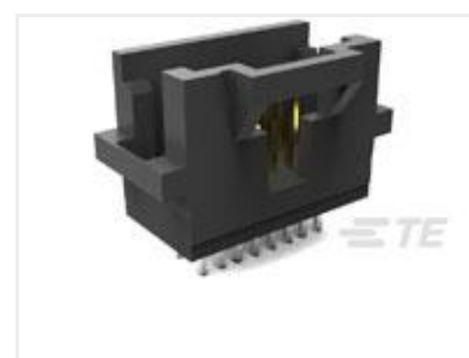
TE Part #6-104068-7 100 SYSTEM 50 HDR DRST SHRD