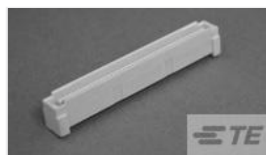
TE Part # 6123001-2 0.8FH,P08H.5,060,30/Sn,TR,SC