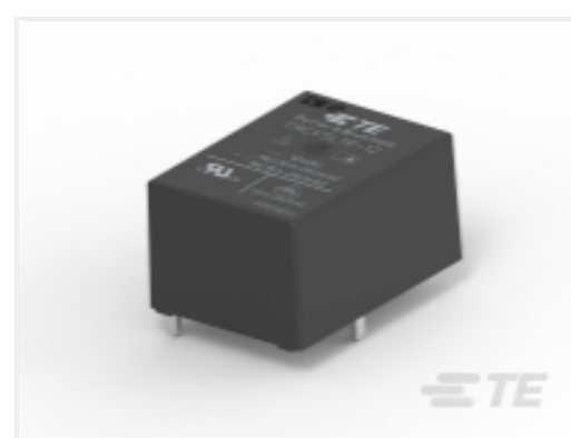
TE Part #1558660-1 T9GV5L14-5