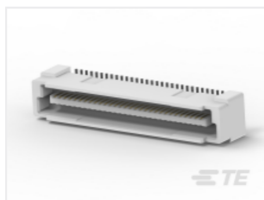
TE Part # CAT-313-PCB60 Free Height Plug Connector: Board-Board, Vertical, 60, 0.8mm