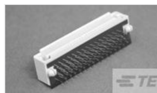
TE Part # 316229-2 0.8 FH PLUG ASSY 60P R/ANGLE