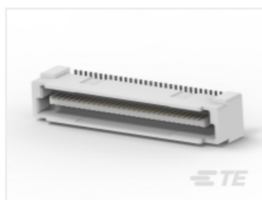
TE Part #5177984-2 Free Height Plug Connector: Board-Board, Vertical, 60, 0.8mm