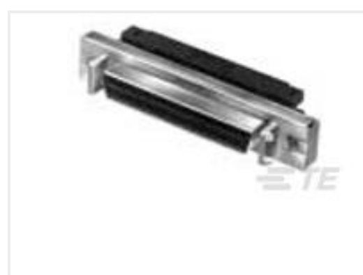
TE Part #1-749656-1 50 50SR PANEL MOUNT RCPT