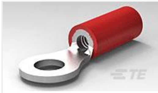
TE Part #32948 PG R 22-16 COMM 22-18 MIL 8