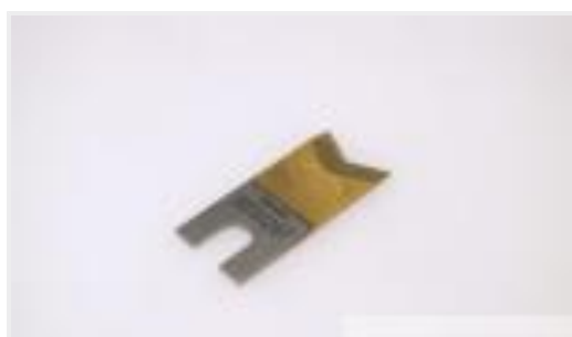
TE Part #874547-5 UPPER CUTTING BLADES