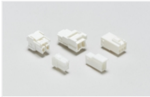
Rectangular Power Connectors(240)