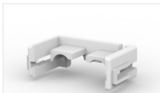
TE Part #177920-1 Power Double Lock TPA