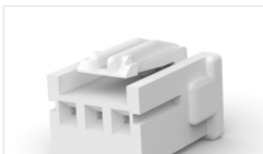
TE Part #917695-1 STD Temp Signal Double Lock Plug