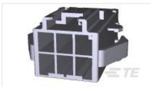
TE Part #177909-1 POWER DBL LOCK CAP HSG P/M 6P