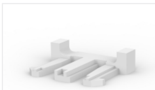
TE Part #917705-1 Signal Double Lock TPA