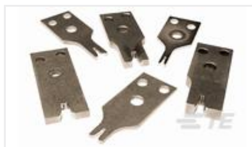
TE Part #3-456403-3 CRIMP,WIRE(062F X 160THK)