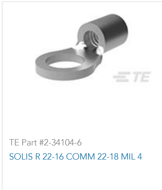
TE Part #2-34104-6 SOLIS R 22-16 COMM 22-18 MIL 4