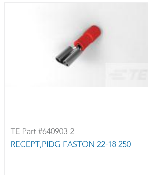
TE Part #640903-2 RECEPT, PIDG FASTON 22-18 250