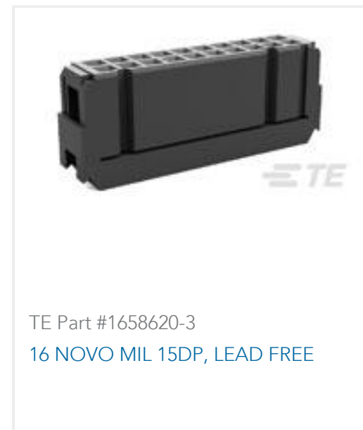
TE Part #1658620-3 16 NOVO MIL 15DP, LEAD FREE