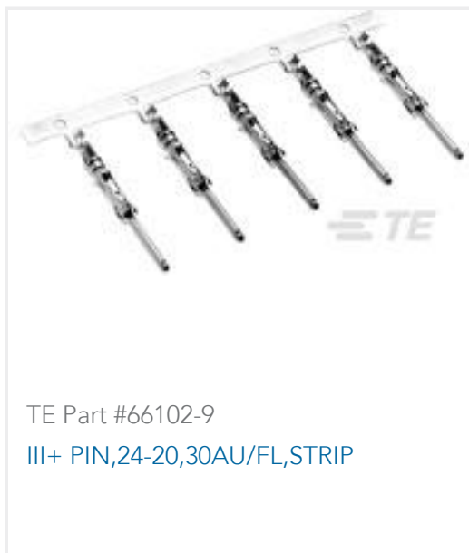
TE Part #66102-9 III+ PIN, 24-20, 30AU/FL, STRIP