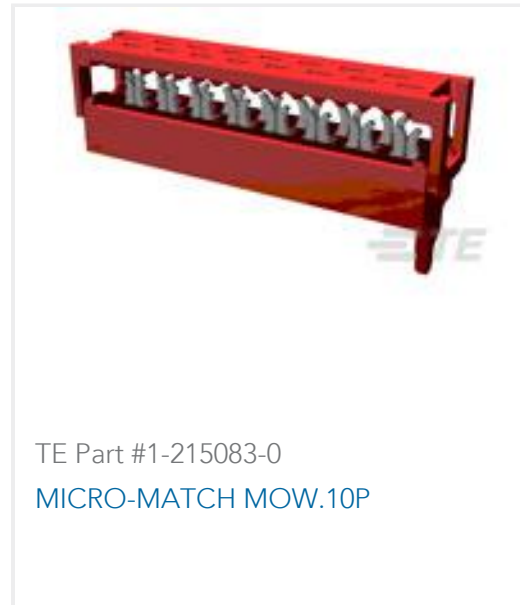
TE Part #1-215083-0 MICRO-MATCH MOW.10P