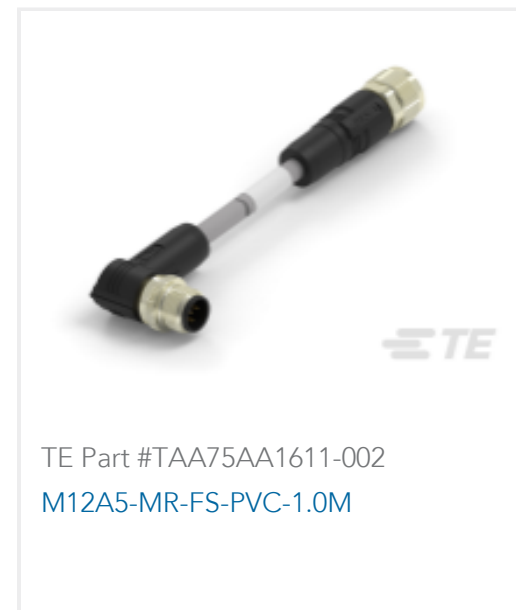
TE Part #TAA75AA1611-002 M12A5-MR-FS-PVC-1.0M