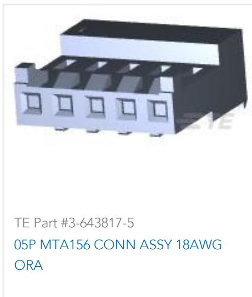
TE Part #3-643817-5 05P MTA156 CONN ASSY 18AWG ORA