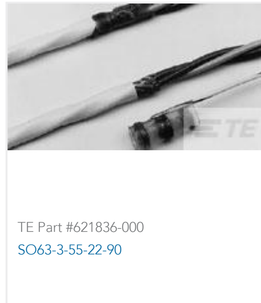
TE Part #621836-000 SO63-3-55-22-90