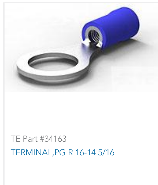
TE Part #34163 TERMINAL,PG R 16-14 5/16