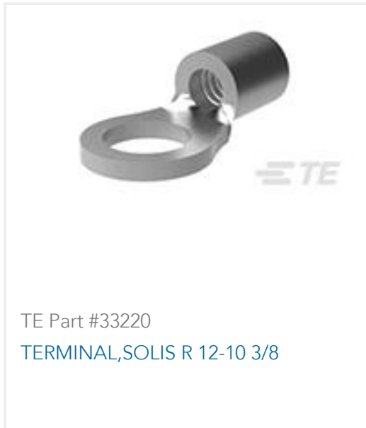
TE Part #33220 TERMINAL,SOLIS R 12-10 3/8