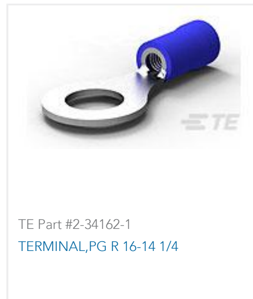
TE Part #2-34162-1 TERMINAL,PG R 16-14 1/4