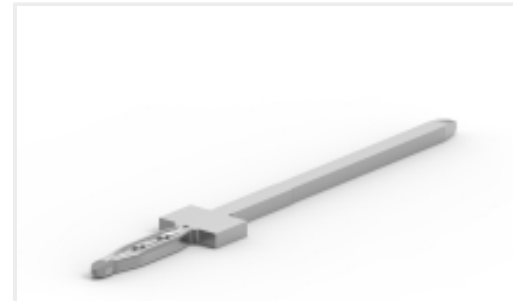
TE Part #1-1452688-2 PRESS FIT PIN TERMINALS