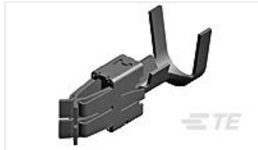
TE Part #1-964330-1 SPT A REC 6.3 Contact SWS Sn