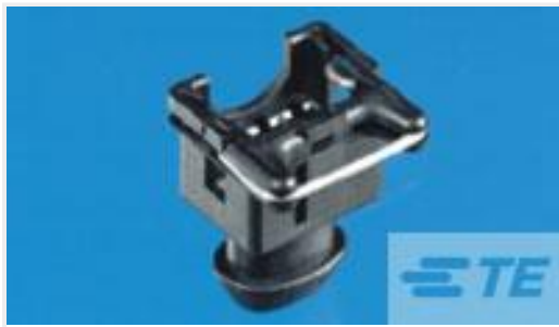
TE Part #282762-2 JPT SPLASH-PROOF FEM.CONN2 POS