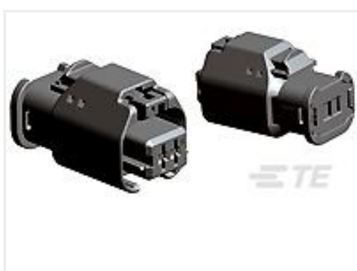
TE Part #1801175-1 2W RECEPTACLE HP CONNECTOR BLACK