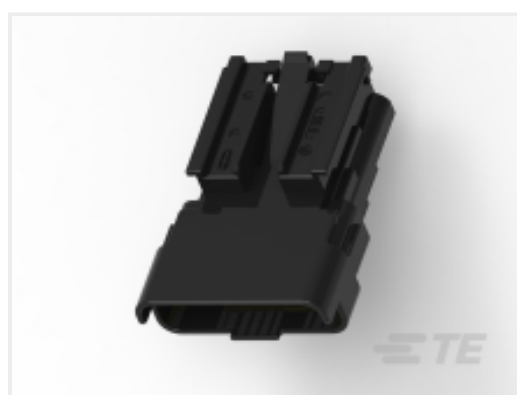
TE Part #3-953657-1 5W TAB HSG ASSY