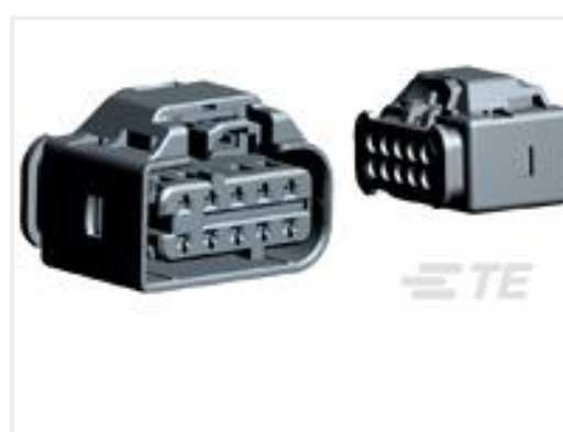
TE Part #1801600-2 RECEPTACLE HOUSING, MCON, 10 W, SEALED