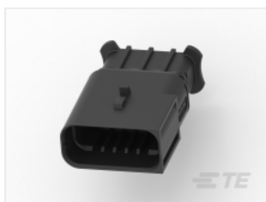
TE Part #1-1801607-6 TAB MAIN HOUSING, MCON, 10 W, SEALED