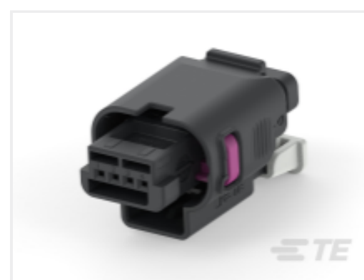
TE Part #1801823-1 4POS, MCON 0.5 CB, REC HSG, BLACK, ASSY, SLD