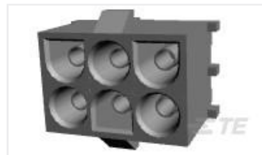
TE Part #350827-1 06P UMNL HDR ASSY PC 94VO