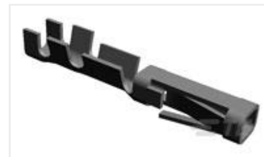
TE Part #181270-3 MOD 2 BUCHSE