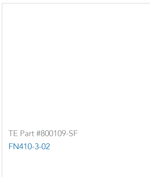
TE Part #800109-SF FN410-3-02