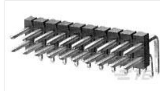
TE Part #1-825457-0 MOD 2 PINHDR 2X10P.