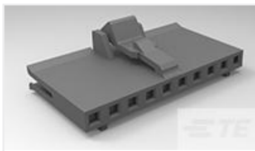
TE Part #487526-8 009 HOUSING FFC RCPT 100CL SR