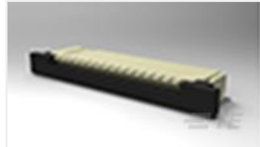
TE Part #84953-8 1MM FPC HORZ.TOP CONT.ASSY 8P