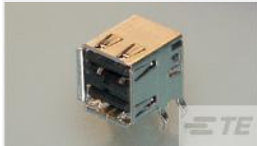
TE Part #1903815-1 INDUSTRIAL USB REC ASSY R/A 2ROW