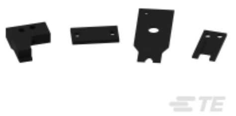
TE Part #690784-1 FRONT SHEAR PLATE