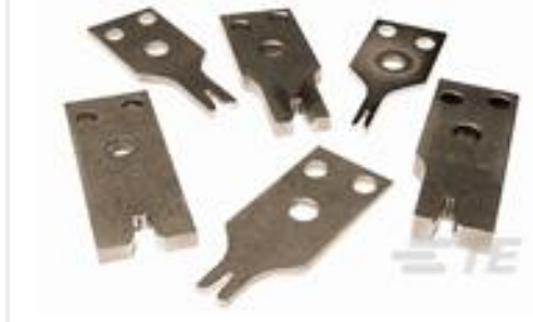
TE Part #456423-5 CRIMPER, WIRE .120 F