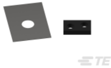
TE Part #690783-3 SPACER PLATE