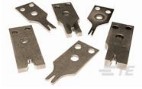
TE Part #6-456134-2 CRIMPER, INSULATION "F"(.220")