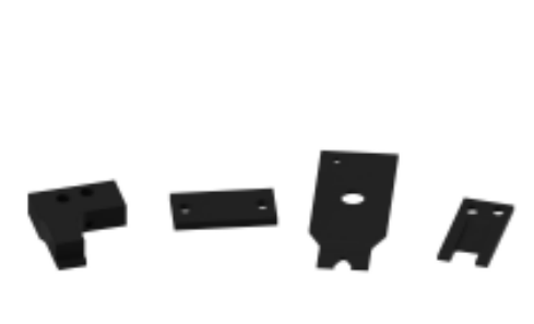
TE Part #240833-2 PLATE, REAR SHEAR