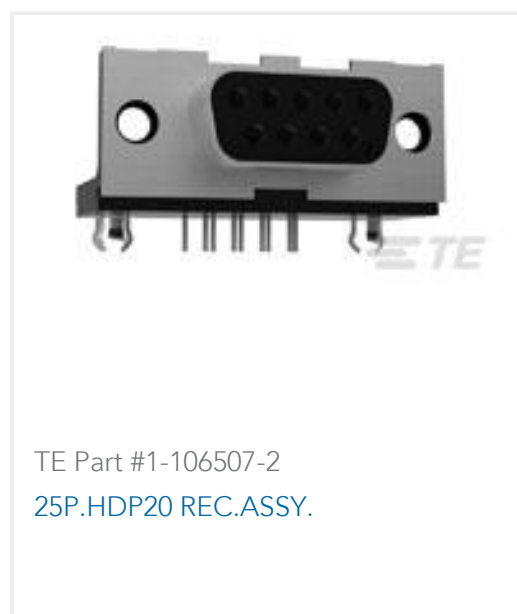
TE Part #1-106507-2 25P.HDP20 REC.ASSY.