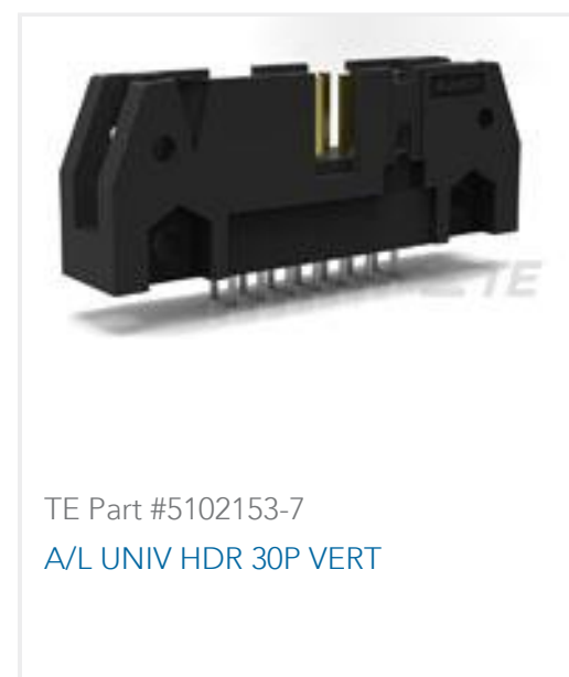
TE Part #5102153-7 A/L UNIV HDR 30P VERT