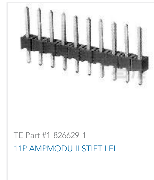
TE Part #1-826629-1 11P AMPMODU II STIFT LEI