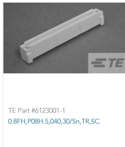
TE Part #6123001-1 0.8FH,P08H.5,040,30/Sn,TR,SC