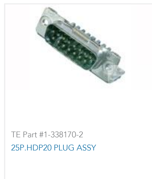
TE Part #1-338170-2 25P.HDP20 PLUG ASSY