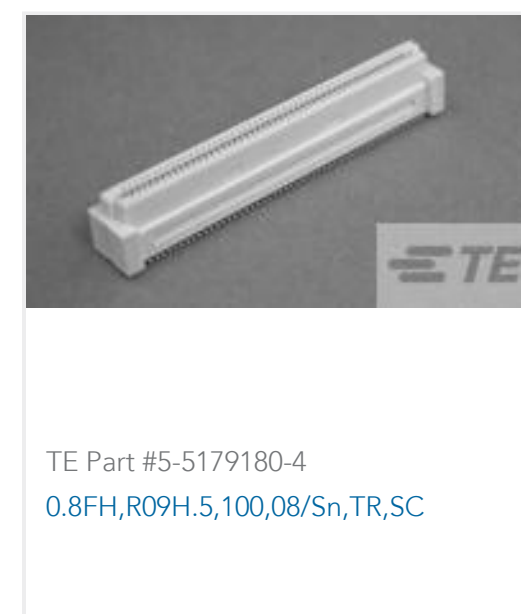
TE Part #5-5179180-4 0.8FH,R09H.5,100,08/Sn,TR,SC