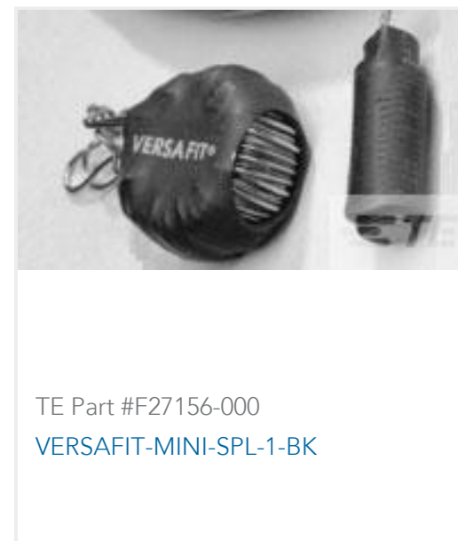
TE Part #F27156-000 VERSAFIT-MINI-SPL-1-BK