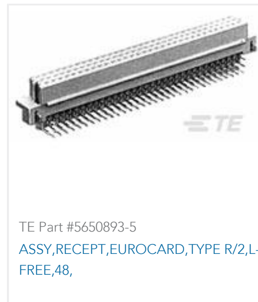
TE Part #5650893-5 ASSY,RECEPT,EUROCARD,TYPE R/2,L-FREE,48,